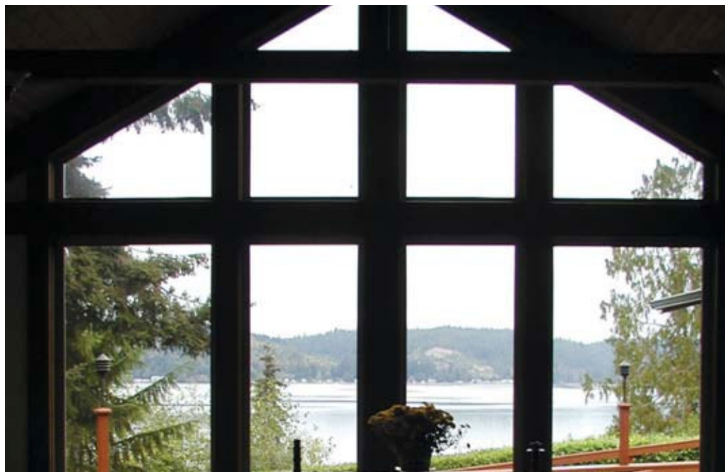
St. Andrew's House, Union WA