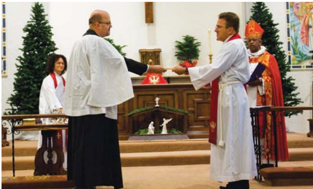
Stan Sholik Photo

But done well, they can also provide a time of healing and grace so that when a new priest is called, the congregation is healthy, self-sustaining and unified. This issue of Vestry Papers looks at both the possibilities and the challenges inherent in such a time.